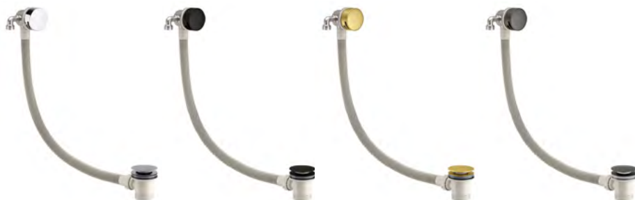
Flow Rates (Litres per minute)